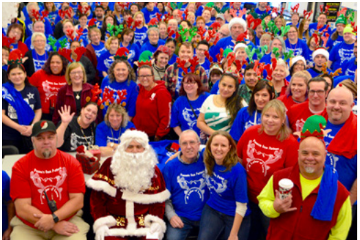
LCSA "Presents from Partners" event

Thank you for your being committed to support Union families. To learn more visit: LCSA: lcsaportland.org or UWCW: unitedway-pdx.org