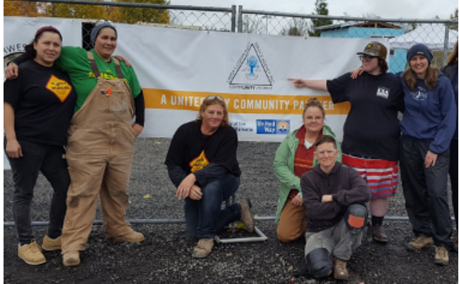
(LCSA members at UWCW service event)

For over 45 years, Labor's Community Service Agency (LCSA) and United Way of the Columbia-Willamette (UWCW) have been working together to make our region a better place for kids and families.