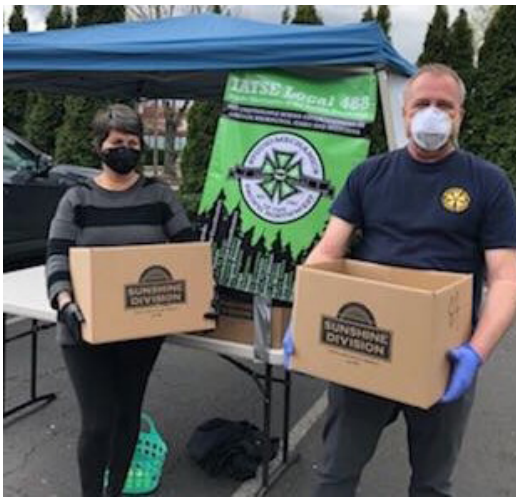
LCSA members providing resources for COVID-19 relief

Throughout the last four decades, your local United Way has stood beside Labor and helped over 15,000 Union families meet their basic needs during a time of crisis, including assisting with rent, utilities, food, and guidance through displacements from disasters.